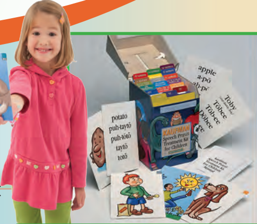
Kit 1 & 2

A proven method for teaching young children to quickly produce and combine the oral motor movements necessary to develop functional verbal language. (Kit 2 not shown)