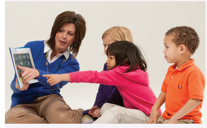
"A wealth of practical information presented in a lively and easy-to-understand manner! One of the best courses I've attended!"

Disclosures: Speaker financial and non-financial disclosures may be found by visiting NorthernSpeech.com/seminars