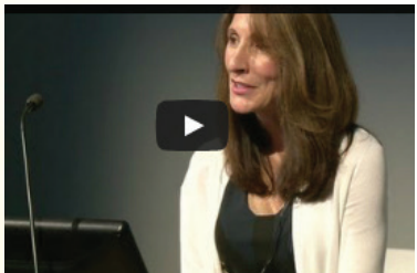
Online CEU course. #e001 $124 0.6 CEUs To Enroll: NorthernSpeech.com/CEUs

This online video course provides a comprehensive introduction to the MBSImP standardized approach and impairment scoring. Serves as an excellent preparatory course prior to enrolling in the MBSImP™ Standardized Training and Reliability Testing.